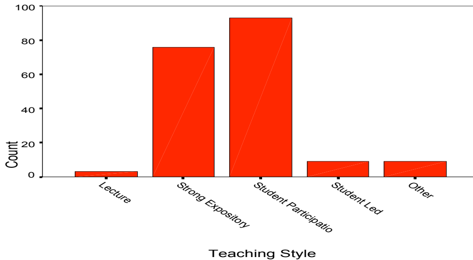
Figure 1: Teaching styles used in secondary classrooms with students with disabilities

Teachers also admitted to having difficulty in modifying curriculum to meet the needs of students with disabilities, with 42.2% of respondents to the questionnaire reporting that they do not modify curriculum at all. Curriculum modification was more likely to occur with integration teachers as 71.4% (25) of integration teachers reported modifying the Curriculum Standards Frameworks (CSFs) compared with 51.0% (75) of subject teachers. Table 1