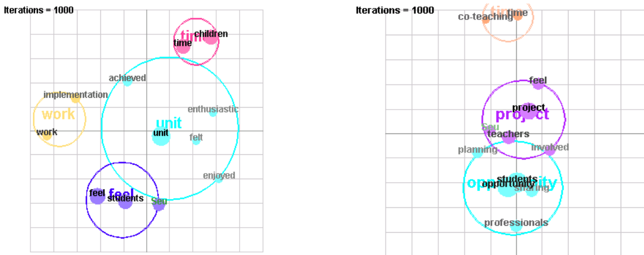
Figure 3. Leximancer analysis of how teachers felt about co-implementation of units of work (Question 4.2) and about the project (Question 5.5).

Figure 4 shows an emphasis on reconstruction in reflection. Three distinct, strongly articulated, and slightly overlapping themes dominated the final whole-group discussion, which focused on preparing the school teams for changes in the coming year. Each separate theme provided a shared perspective on the inclusion of students with disabilities into core curriculum. The school theme was also linked to a minor project theme about how the project fostered this school approach. The think theme about people and SEU kids and other children in the regular classroom was linked to a minor group theme on classroom groupings of children. The work theme about the role of the special education teacher in the regular class was linked to a minor team theme that actually involved co-occurring concepts of time, feel, and team across three theme boundaries (e.g., expected difficulties ahead in having time to do thorough unit planning and feelings about working in teams). A separate minor room theme also concerned expected structural problems next year about adequate classroom spaces and proximity to withdrawal room: Although expressed mainly by teachers from one school, these issues affected all schools.