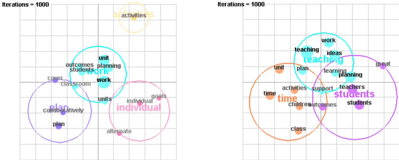
Figure 1. Leximancer analysis of teaming responses (Question 1.1, Session 1 vs. Final reflective statements, Session 3).